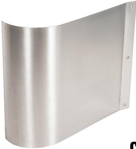
PG8000 Panic Guard/Latch Guard