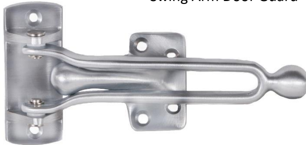
4016 Swing Arm Door Guard