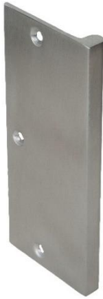
APC30-6 6" Edge Pull