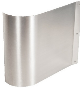
PG8000 Series Latch Guards