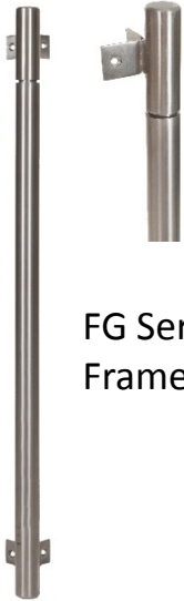
FG Series Frame Guards